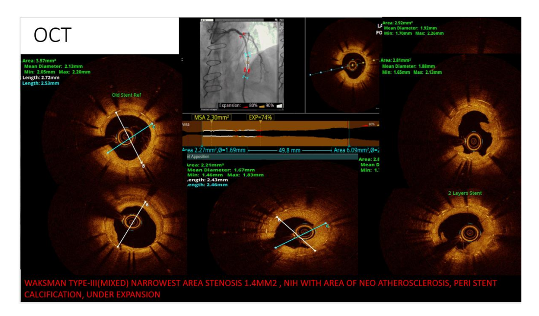
Fig. 1. OCT images demonstrating neoatherosclerosis, neointimal hyperplasia, persistent calcium & stent under expansion

Rangan et al.; Asian J. Cardiol. Res., vol. 8, no. 1, pp. 1-8, 2025; Article no.AJCR.128972