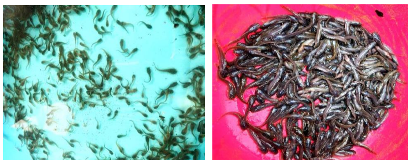
Fig. 2. (a) 21-day-old fry; (b) 50-day-old fry (source, author)

Fry at 21 days and 50 days post-hatching are shown in figures.