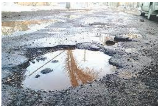
Picture 5. Abuja Road