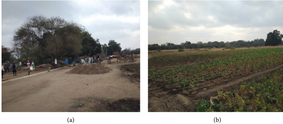
FIGURE 4: (a) Community members pulling resources together, which includes the human capital to resuscitate Magogogwe irrigation scheme. (b) Wilting legume crops failing at the partially functional Manjinji irrigation scheme.

which could be attributed to climate variability, particularly local droughts that would negatively impact forage resources [18]. During the survey, it was found that most communal farmers in this area have low knowledge about feedlots or fodder for animals. This study established that farmers in Malipati Communal Area were indifferent regarding climate change and variability, and as a result, they have not fully embraced ideas to cope with climate change and variability. It was found that ideas including production of small grains, having feedlots, and growing fodder crops have not yet been embraced by farmers in Malipati Communal Area. Hence, there is a need for the construction of cattle feedlots and creation of an animal feeding surplus facility where communities could easily access fodder for their animals during dry seasons.