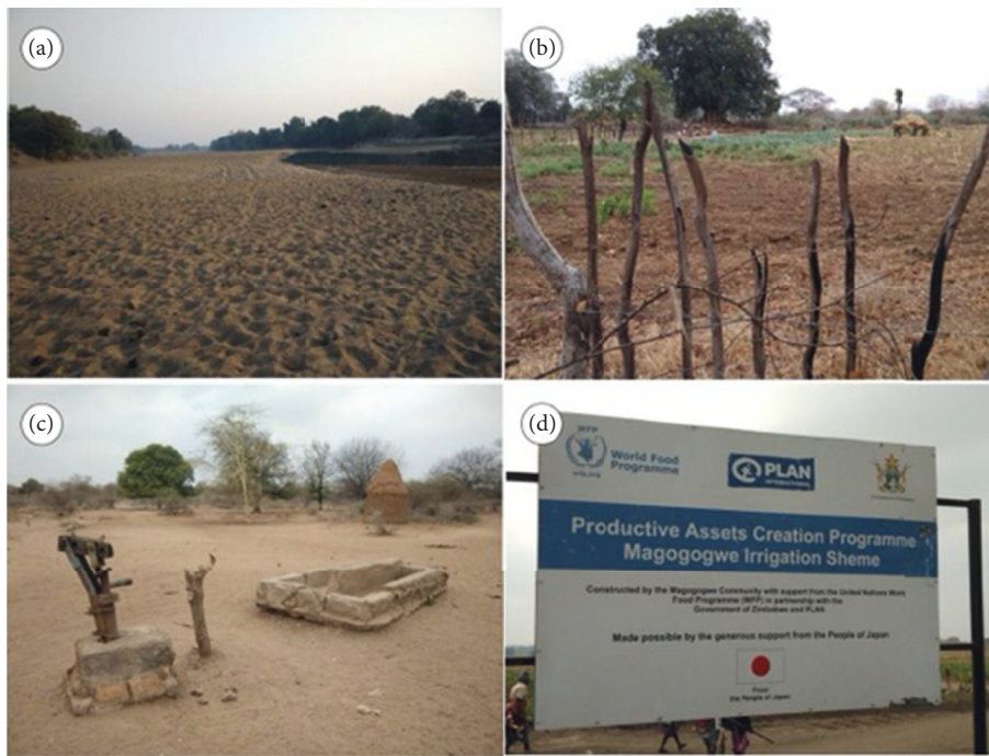
FIGURE 3: (a) Siltation of Mwenezi River, which is the only convenient source of water for the two irrigation schemes in the study area, (b) small garden sustained by a shallow well in Muhlekواني Village, (c) a defunct borehole in Ngwenyeni Village as the water table was reported to be very low due to climate change and variability, and (d) World Food Program project partnering communities in resuscitating an irrigation scheme.

flow in rivers. Figure 4 shows community members pulling resources together, which includes the human capital to resuscitate Magogogwe irrigation scheme, and wilting legume crops failing at the partially functional Manjinji irrigation scheme.